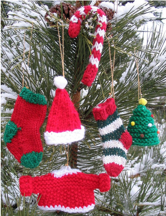
Copyright 2008 – Designs by KN